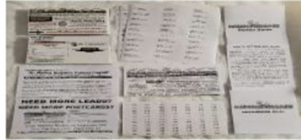
(The Mailbox Benjamins Marketing Kit)

Mailbox Benjamins is a simple 2 Level High Commission postcard program that pays you $500 per direct sale and $200 sponsor overrides, so this gives you 2 permanent pay positions to make $500 and $200 payments over and over again, not only from your efforts, but from the efforts of all your sponsored members forever!