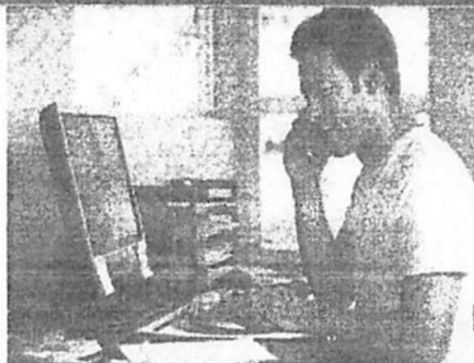
May 2022 Issue